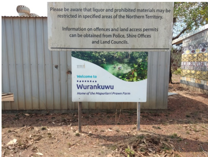
Fig. 1-3 Wurankuwu homeland and Prawn farm site