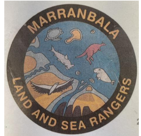
Photo: This is the Marra Rangers logo. It shows Marra country and the animals we want to look after as totems. The way we look after this country as a ranger, is also how we should look after it as a researcher.