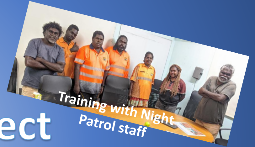
Training with Night Patrol staff