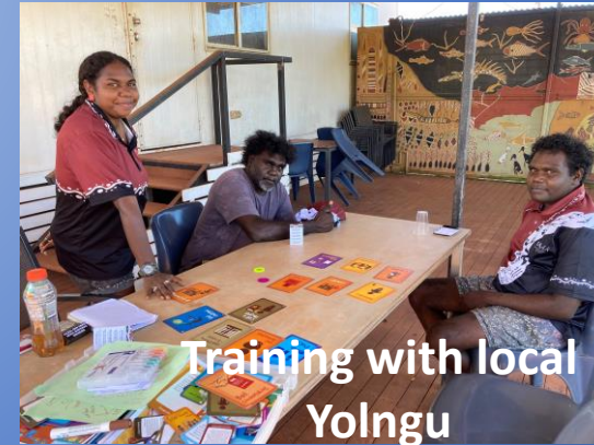
Training with local Yolngu