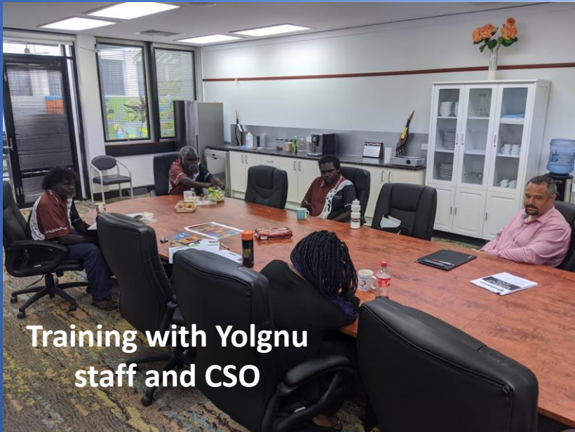
Training with Yolgnu staff and CSO