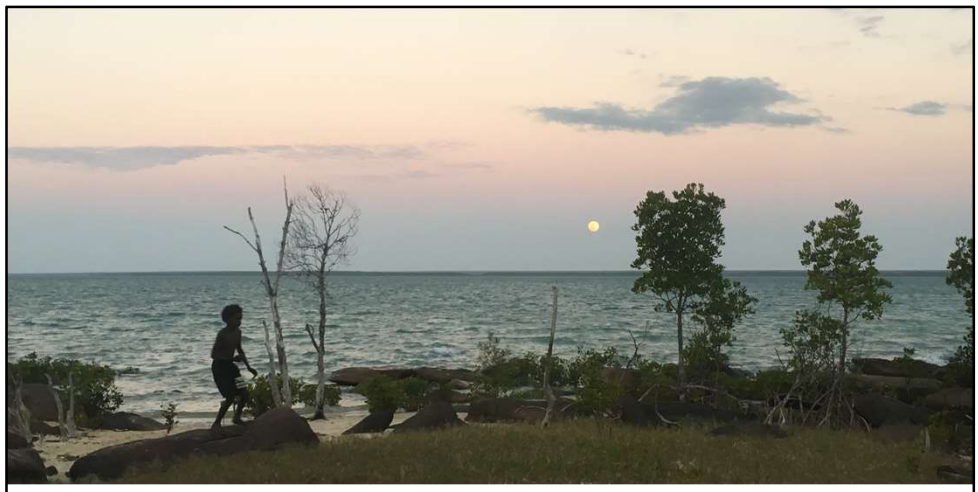
Galawarra Moonrise – Monitoring and Evaluation Ground Up and Yolŋu way